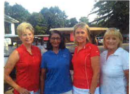
The SCC Ladies' Golf Association recently held their three day championship.