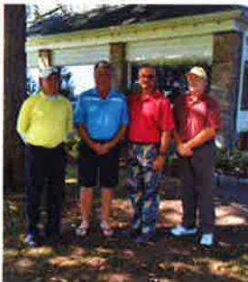
1 st Flight Winners