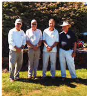
2 nd Flight Winners