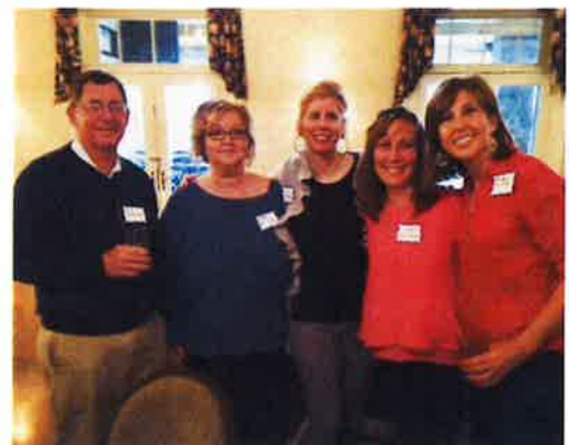
Thank You, Central Berks Dental Center for joining us at SCC!