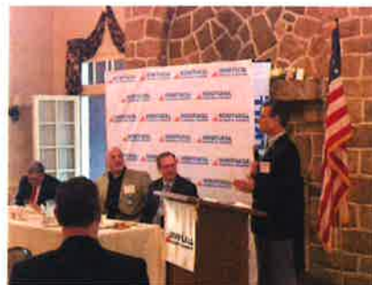
Thank You, Schuylkill Chamber of Commerce for joining us at SCC!