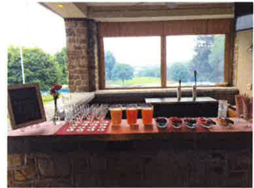
Mimosa's Anyone? Add a Mimosa Bar to your next SCC Celebration!