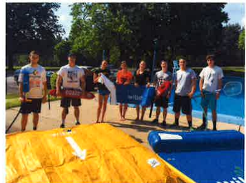
SCC's 2016 Lifeguard Team is ready for summer!